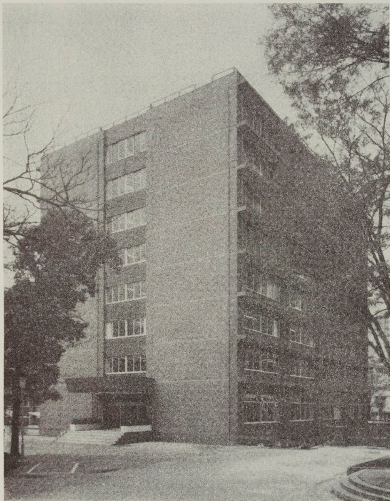
THE INSTITUTE OF ORIENTAL CULTURE Established in 1941